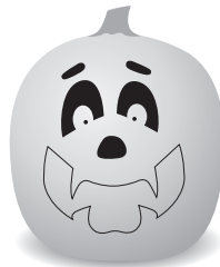
Drill and carve out